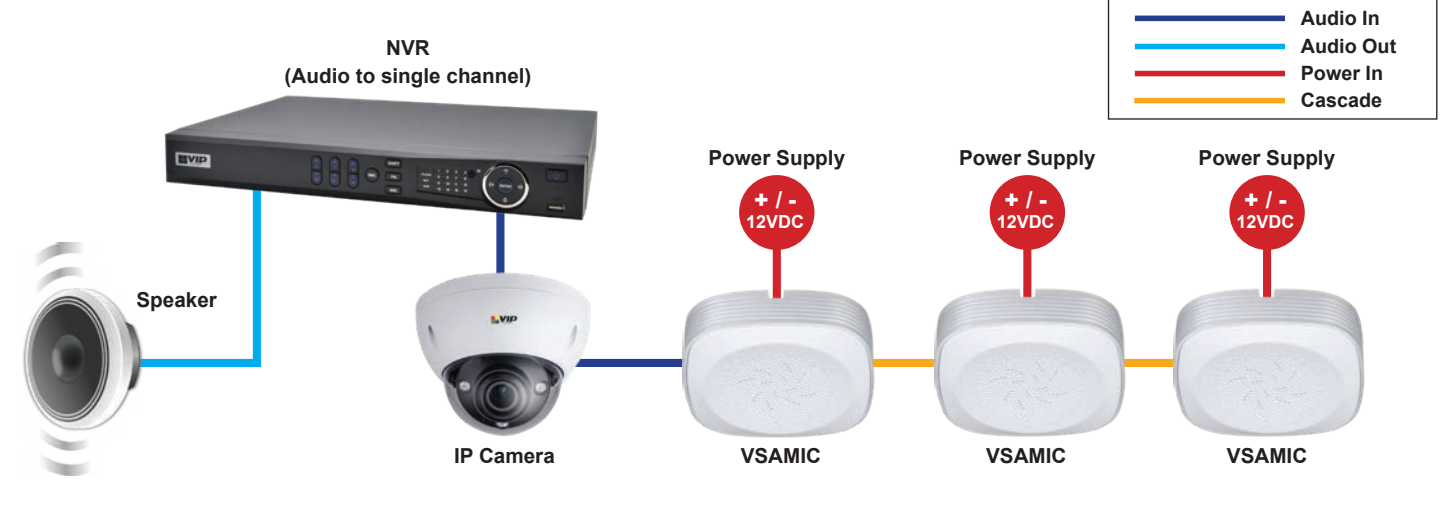
Your local VIP Vision<sup>™</sup> IP solutions professional: