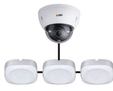
Cascade Multiple Microphones