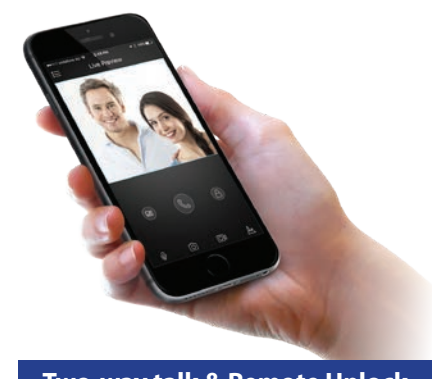
Two-way talk & Remote Unlock