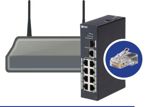
Connect via WiFi or Network Cable