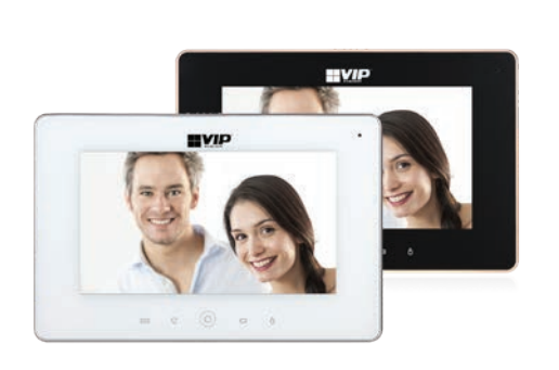
7" Slimline Touchscreen Monitor