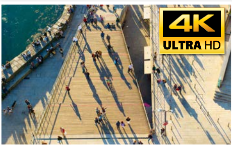
Record up to 4K in Real Time (25fps)