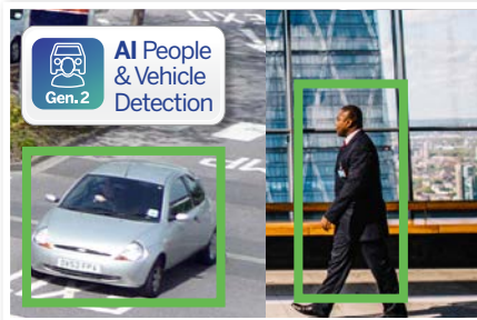
Smart Person & Vehicle Detection