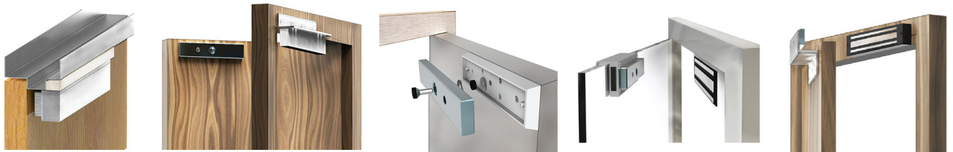
Filler Bar (MAGLOC-ABS and MAGLOC-ABL)