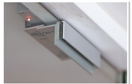
Wide Range of Accessories